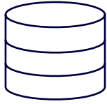
ELN (e.g., Benchling)